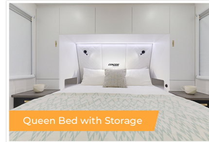
Queen Bed with Storage