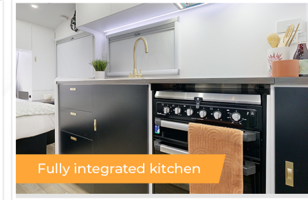
Fully integrated kitchen