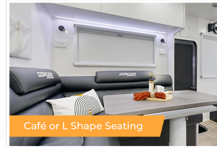
Café or L Shape Seating